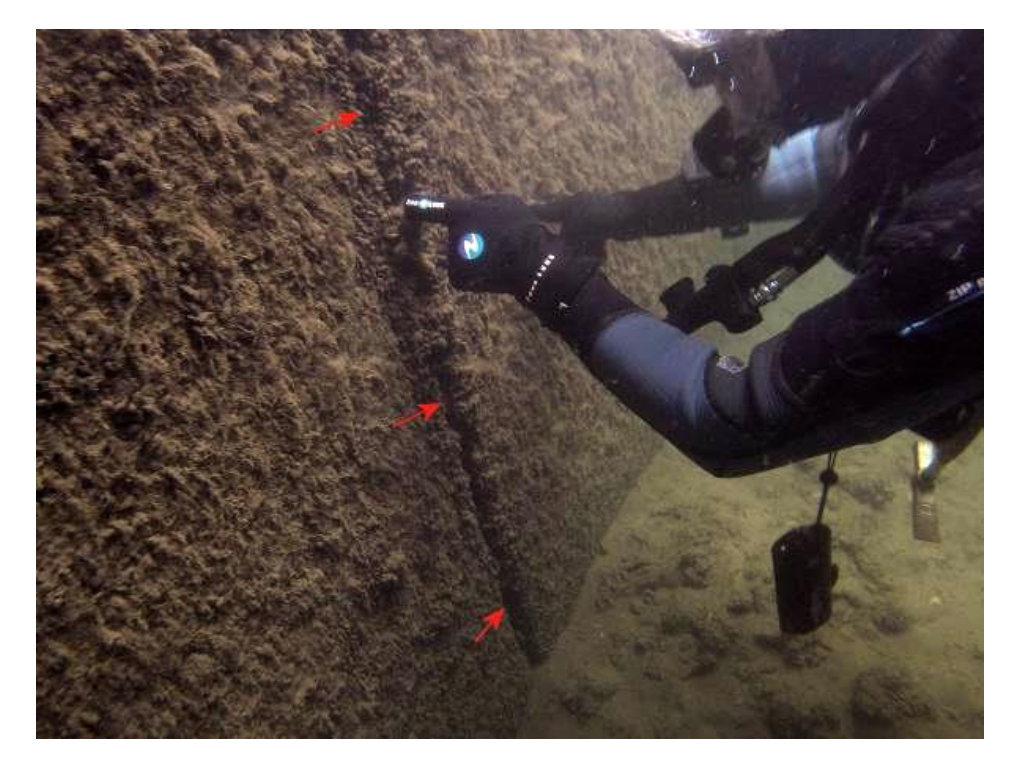
Figure 2: Technical inspection by Scientific Divers. Especially the in-situ documentation is crucial as an objective risk assessment is not possible from the water surface.

Scientific Divers can assess complex in-situ-measurements and targeted sampling or long time monitoring. A wide field of scientific topics, including chemistry, thermodynamics, microbiology and many more, is covered. Combined with detailed high-quality photo and video documentation, a reproducible workflow is applied, which makes the situation underwater accessible to non-diving engineers for further planning. This interdisciplinary approach comprises also sound methods for technical surveys on dams (e. g. dam inspection or damage documentations).