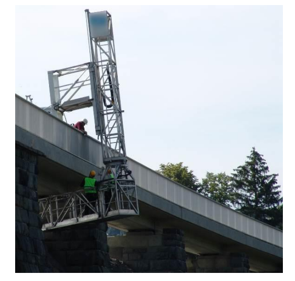
Figure 1: Technical inspection at high altitudes with an underbridge-inspection-unit.